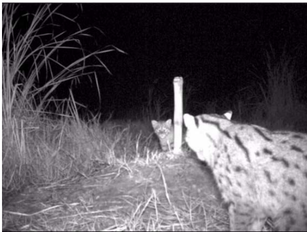
Wishbone and her kitten