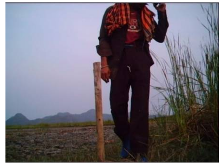
A local farmer has a look at one of the cameras