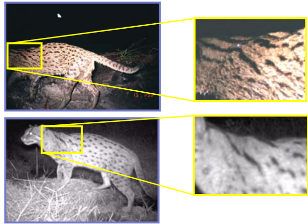
Initial analysis indicates that individual identification based on pelage markings is possible. Video images allow for extraction of still images with optimum perspective and angle for comparison of animals.

Three semi-natural reed grass patches were targeted for camera trapping. A total of 230 video clips and 238 still photos were recorded during 54 trap nights at sites clustered around these three patches. Fishing cats had the highest capture frequency with 203 exposures obtained from 15 distinct locations during 20 of the 54 trap nights. Analysis of the size, pelage patterns, body characteristics, condition, and behavior indicated that these captures represented at least three (an adult female, a ~3-4 month-old kitten, and another (apparently male) adult missing a right front paw) and potentially four or more