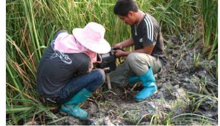
Setting up an automated photo and video trap