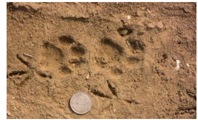
Tracks encountered during Sign surveys