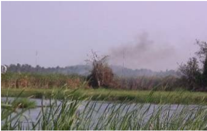
Annual burning of rice fields