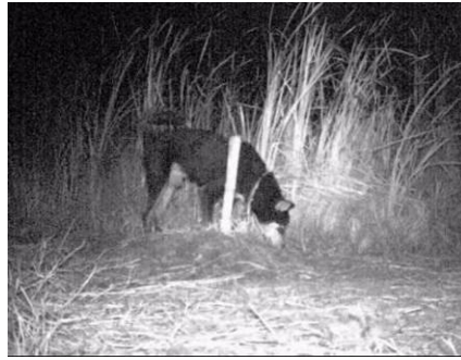
A domestic dog investigates a trap station