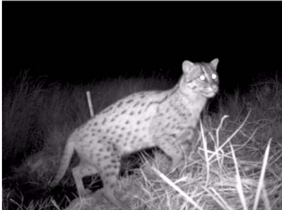
Adult female named "Wishbone" due to the Y-shaped pattern on her right shoulder resembling a wish bone

individual fishing cats. The three trapping clusters formed a roughly north-south axis with the distance between clusters ranging from 0.9 to 2.8 kilometers. The female/kitten pair was photographed in each patch whereas the adult male may only have been photographed only in the southernmost patch.