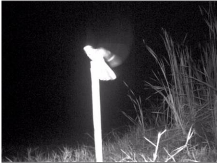
A nightjar lands on one of the stakes used to secure bait

Also captured in camera traps were a nightjar, another (unidentified) bird, several large rats, numerous domestic cattle, two domestic dogs, and one local farmer.