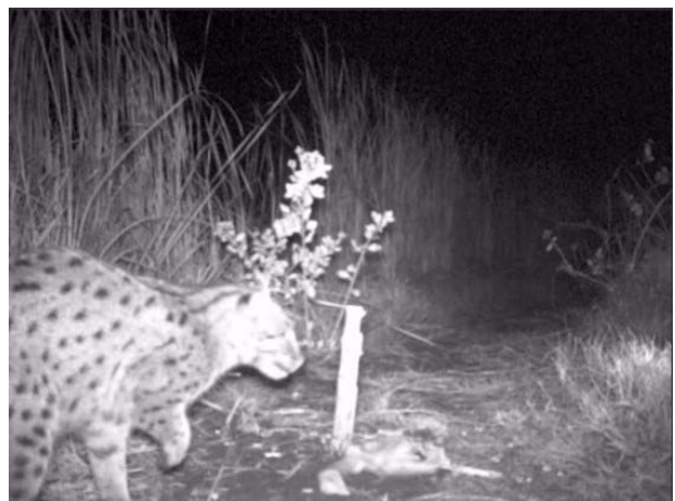
"Peg leg" -- a male fishing cat that lost his right paw escaping from a cable snare