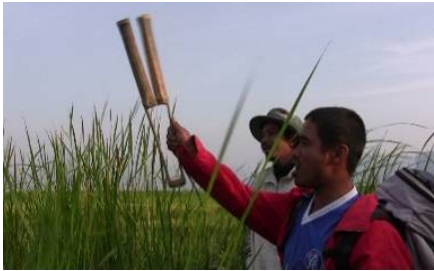
Noisemaker for scaring birds