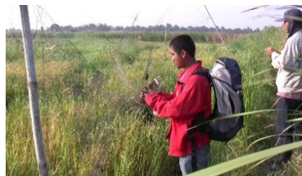
Rescuing a nightjar from a mistnet in the agricultural areas around Khao Sam Roi Yod National Park