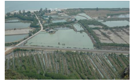
Mangrove reforestation area, shrimp farms, and coastline as seen from a viewpoint ~300 m above sea level