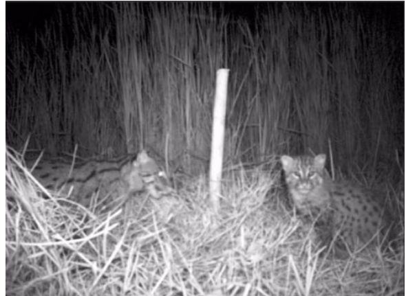
Wishbone and her kitten