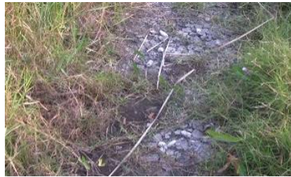
A latrine site