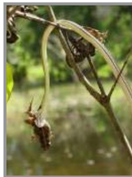
Common Bronze-backed snake preying on a frog