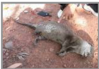
A snared small-clawed otter