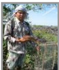
Another bird rescued from a fish trap