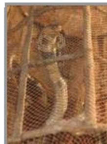
Nature Path construc