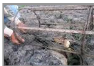
Another bird found in a fish trap