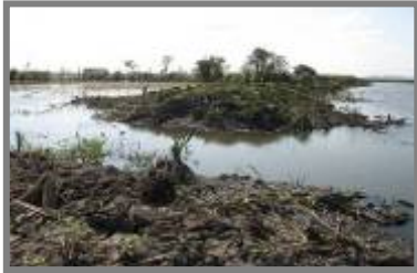
Dirt path dug up to turn into a nature path