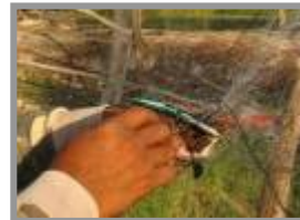
Rescuing king fishers