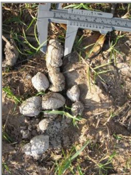
Measurement of feces collected in the field