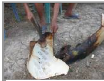
A villager demonstrated how to make a snare