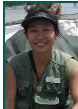
Passanan Cutter Principle Investigator