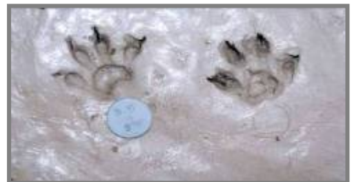
Kanchanasakha's reference photo compare with field reference