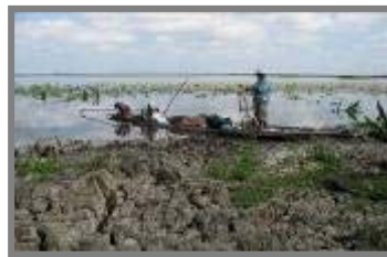
Another type of fishing