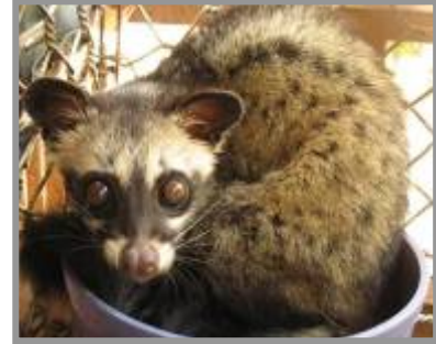
Common palm civet