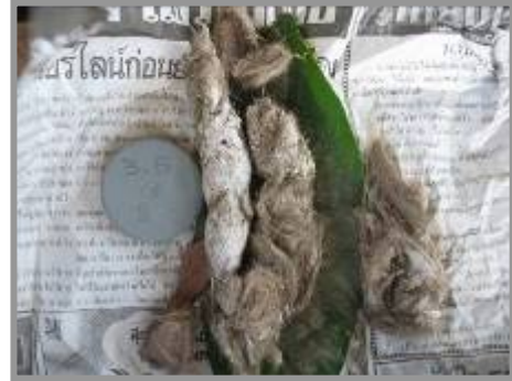
Small carnivore feces collected from the field