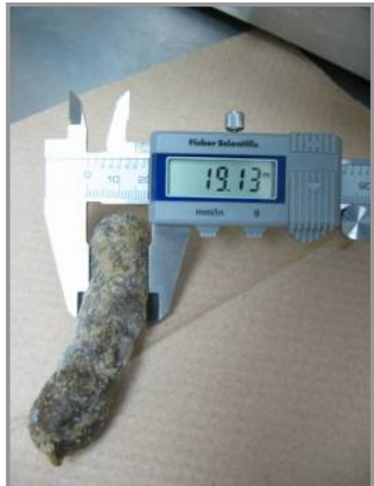
Measurement of feces collected in from a female captive fishing vat