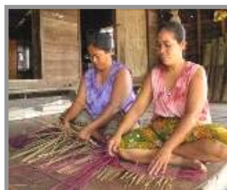
Bulrush sedge weaving