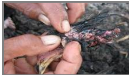
Remains of a live bait after taken by what we thought was a