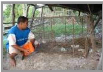
Local made fishing cat