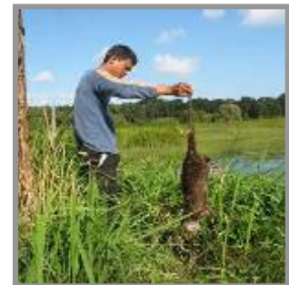
Location where a snared small-clawed otter was found dead