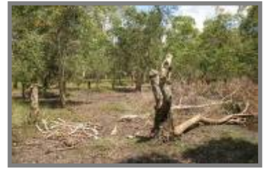
Melaleuca forest clearing