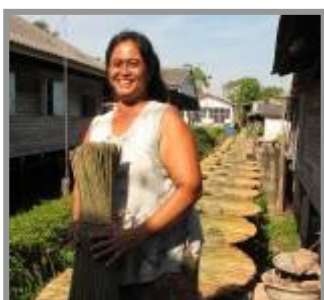
Drying Bulrush sedge