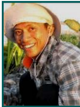
Rittirong Rittikul Klongsaeng Wildlife Research Station