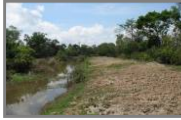
A fire buffer path