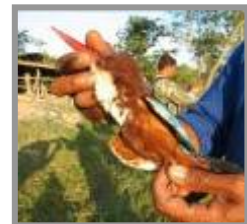
Rescued king fisher