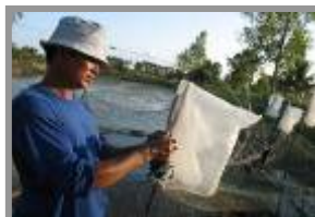
White collared king fisher trapped on fishing net